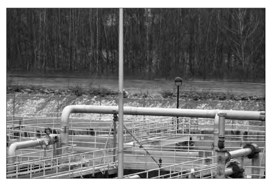
Figure 5 - Pawtuxet River crests the western side of the levee at approximately 1:15 PM on Tuesday, March 30, 2010, and begins flooding the treatment facility.

Shortly after the treatment facility flooded, the Mayor of Warwick declared a State of Emergency and activated the City's Incident Command Structure (ICS). WSA was hurriedly added to the ICS organizational chart and briefed