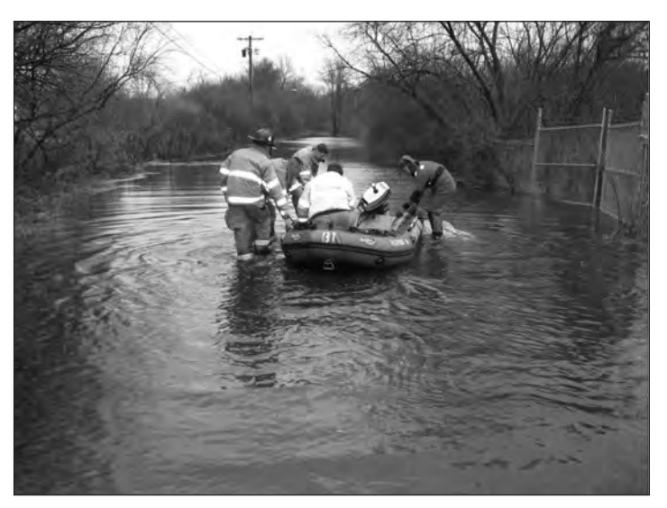
Figure 7: WFD assists WWTF mechanics to boat over 500 feet to the Knight Street pumping station for a check after the March 30th storm.

The City's website and a message with updates on the main telephone line were helpful. Using Reverse 911, the City of Warwick was able to reach lots of people very quickly (over