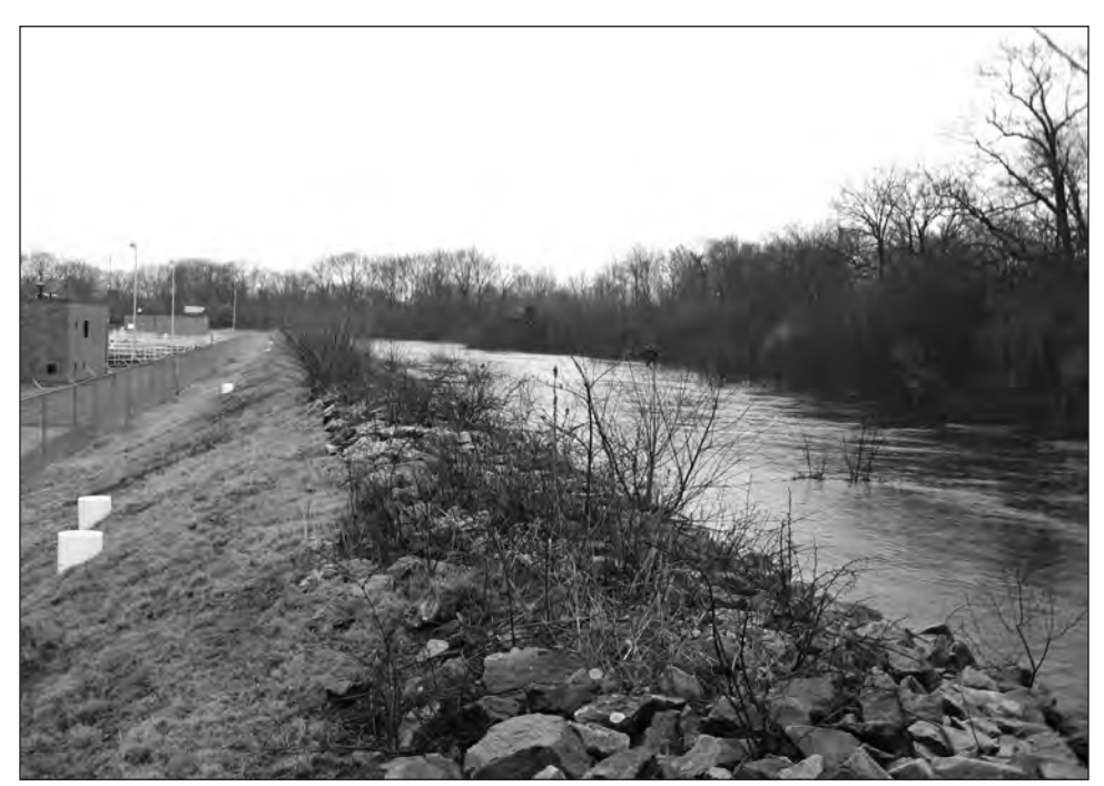
Figure 3 - Western Side of Levee at Warwick Wastewater Treatment Facility, March 15, 2010.