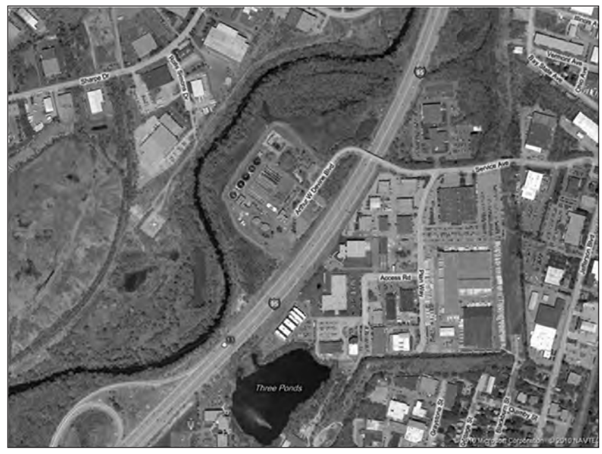
Figure 1 - Aerial of Warwick WWTF

Survey (USGS) gauge on the Pawtuxet River at the Warwick-Cranston line: 14.98 feet on March 15th and 20.79 feet on March 31st. On March 30, 2010, the Pawtuxet River breached the levee surrounding the WSA's wastewater treatment facility, filling the campus with an estimated 75 million gallons of stormwater and wastewater. The Flood completely wiped out the treatment processes as well as six (6) pumping station located along the banks of the Pawtuxet River.