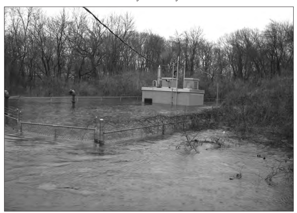
Figure 4 - Knight Street Pumping Station, located in a Pawtuxet River floodway, during The Little Flood. The station was designed like a submarine to operate in flood conditions. Note the smoke visible from the generator smokestack. This station pumped a lot of river water to the treatment plant before it was shut down in The Big Flood.