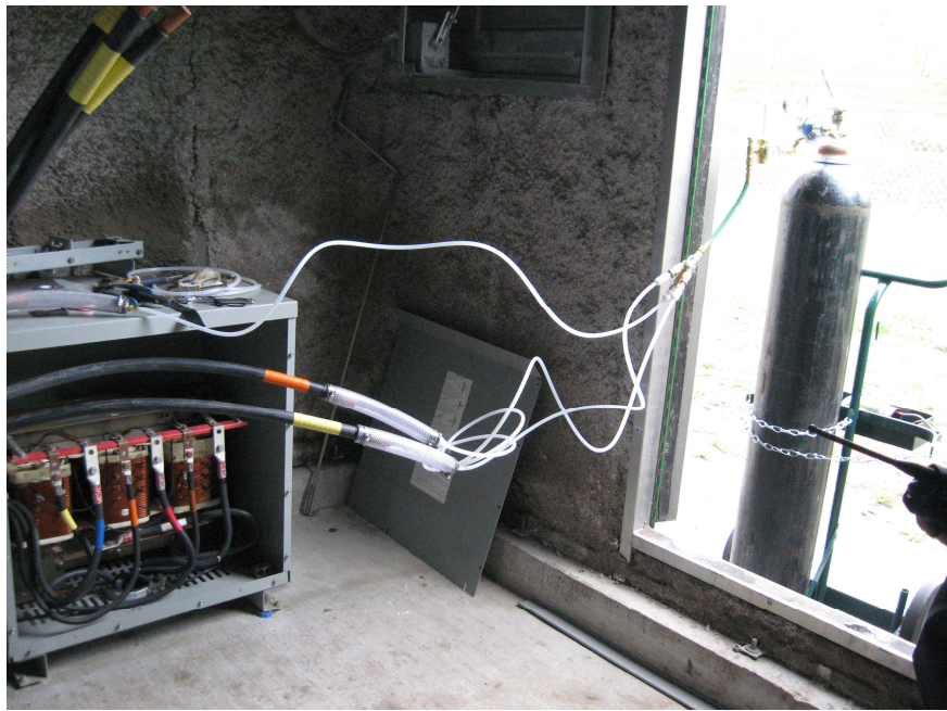
Figure 11: Nitrogen Gas Drying Test.