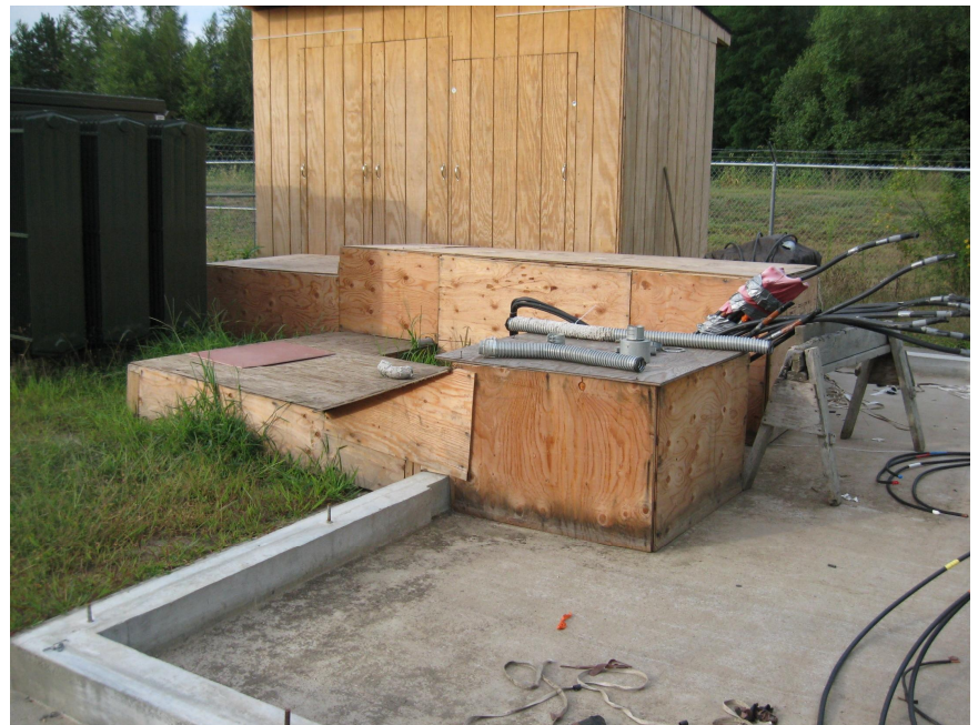
Figure 10: Temporary Switchgear Housing.