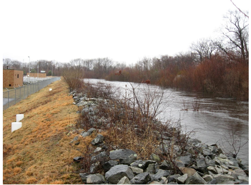
Figure 2: Western Side of Levee at Warwick Wastewater Treatment Facility, March 15, 2010.