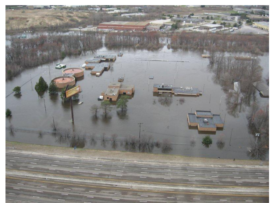
Figure 5: Flooding at the WWTF on April 1, 2010.