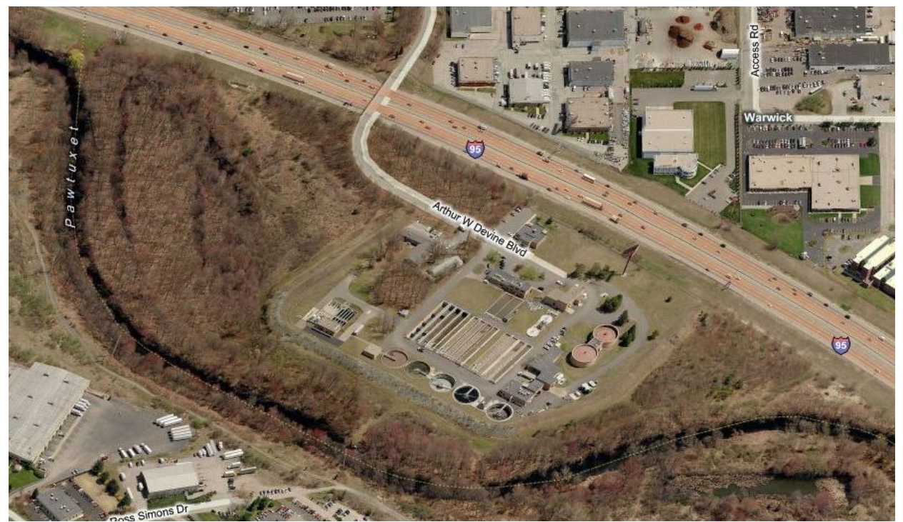
Figure 1: Aerial of Warwick WWTF

The WWTF is located in a meander of the Pawtuxet River. The river wraps around the WWTF on three sides, with Interstate 95 (I-95) bordering the WWTF to the east (refer to Figure 1). After repetitive flood damage to the WWTF in the 1960s and 1970s, the City constructed a protective levee in the mid-1980s to protect the WWTF from future damages. The City's Animal Shelter is also located within the confines of the levee. The levee was designed to protect to the 100-year flood level, plus three feet of freeboard. For all but a few days per year, treatment plant effluent flows by gravity to the Pawtuxet River. During times of high water, pumping is needed to convey the final effluent to the river.