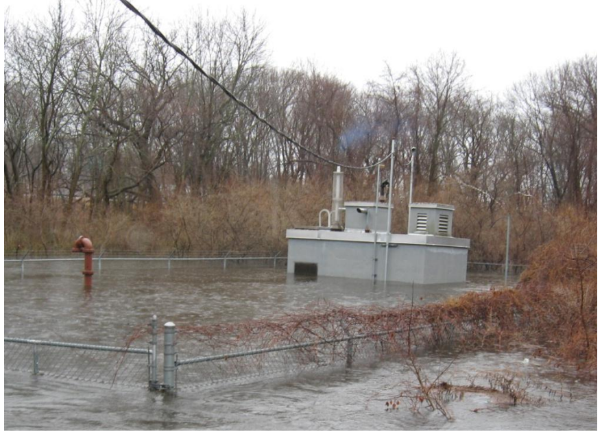
Figure 3: Knight Street Pumping Station, located in a Pawtuxet River floodway, during March 15, 2010 flood.

As O&M crews struggled to get the damaged pumping stations operational, Rhode Island continued to receive more rain. Less than two weeks later, meteorologists and emergency management professionals started to warn local Emergency Management Agencies about heavy rain and flooding predictions. On March 27, 2010, heavy rain began again. On Tuesday morning (March 30<sup>th</sup>), although it continued to rain hard, the National Oceanographic and Atmospheric Agency (NOAA) was still predicting Pawtuxet River elevations that were below