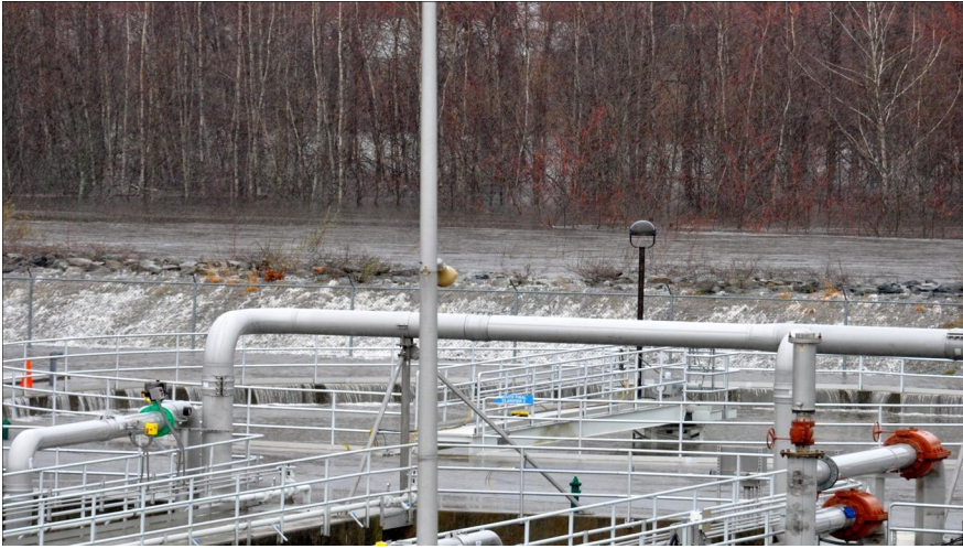
Figure 4: Pawtuxet River crests the western side of the levee at approximately 1:15 PM on Tuesday, March 30, 2010, and begins flooding the treatment facility.

This flood was initially classified as between a 100-year and a 500-year event. The month of March set two new records for river level and was the wettest month on record. Figure 4 displays a photo of the site shortly after the levee was breached. Figure 5 displays a photo of the site after the flood waters began to recede.