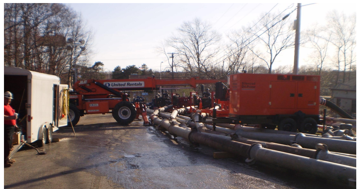
Figure 6: Portable Pumps Dewatering the WWTF Site.

On Saturday, April 3<sup>rd</sup>, more permanent but still temporary electrical power was established with the cooperation of National Grid. As tanks were dewatered, wastewater flow was directed through the primary and aeration tanks at the plant to the chlorine contact basin where a temporary chlorine drip disinfection process was assembled. Because the river was still high, wastewater could not flow by gravity through the outfall. Temporary pumps were set up at the chlorine contact basin as shown in Figure 7 to pump flow into the river. Because none of the equipment was operational, wastewater flowing to the plant was receiving the rough equivalent of primary treatment and disinfection. The flood water was gone at this point, leaving behind thick layers of sludge and debris. By Sunday, April 4<sup>th</sup>, maintenance crews succeeded in restoring all remote pumping operations and flushing restrictions were eased.