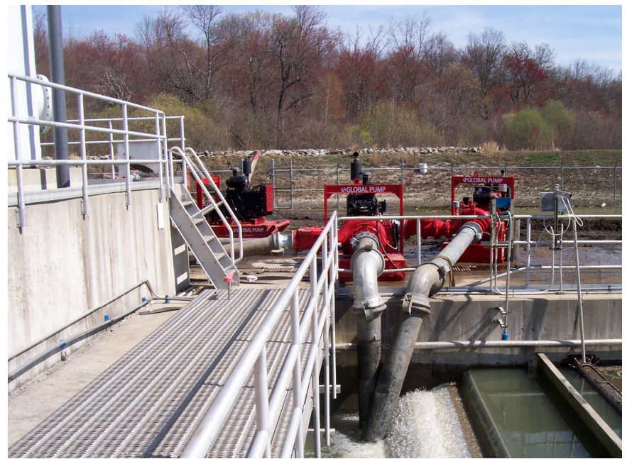
Figure 7: Portable Pumps Pumping Effluent.