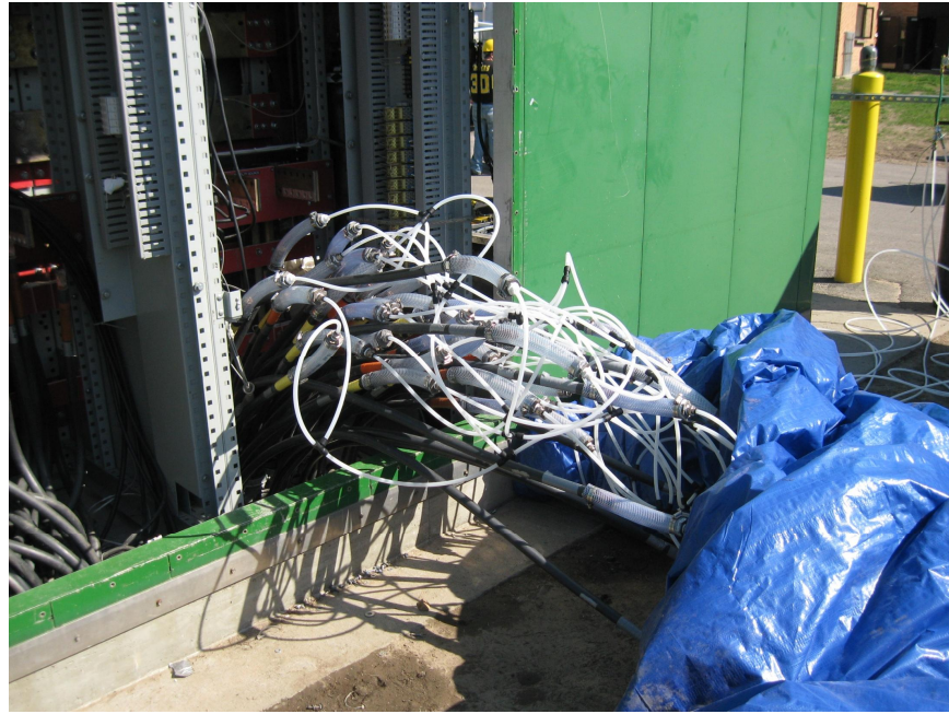
Figure 12: Nitrogen Gas Drying Manifold.

While the nitrogen gas drying was completed, electricians began work on replacing all the smaller conductors on-site. The SCADA system prior to the flood relied on hundreds of signaling wires. These were replaced with a new fiber loop that is rated for submergence in case of another flood. The plant ran with this temporary electrical system for approximately five months while the replacement MCCs, switchgear, and emergency generator were manufactured.